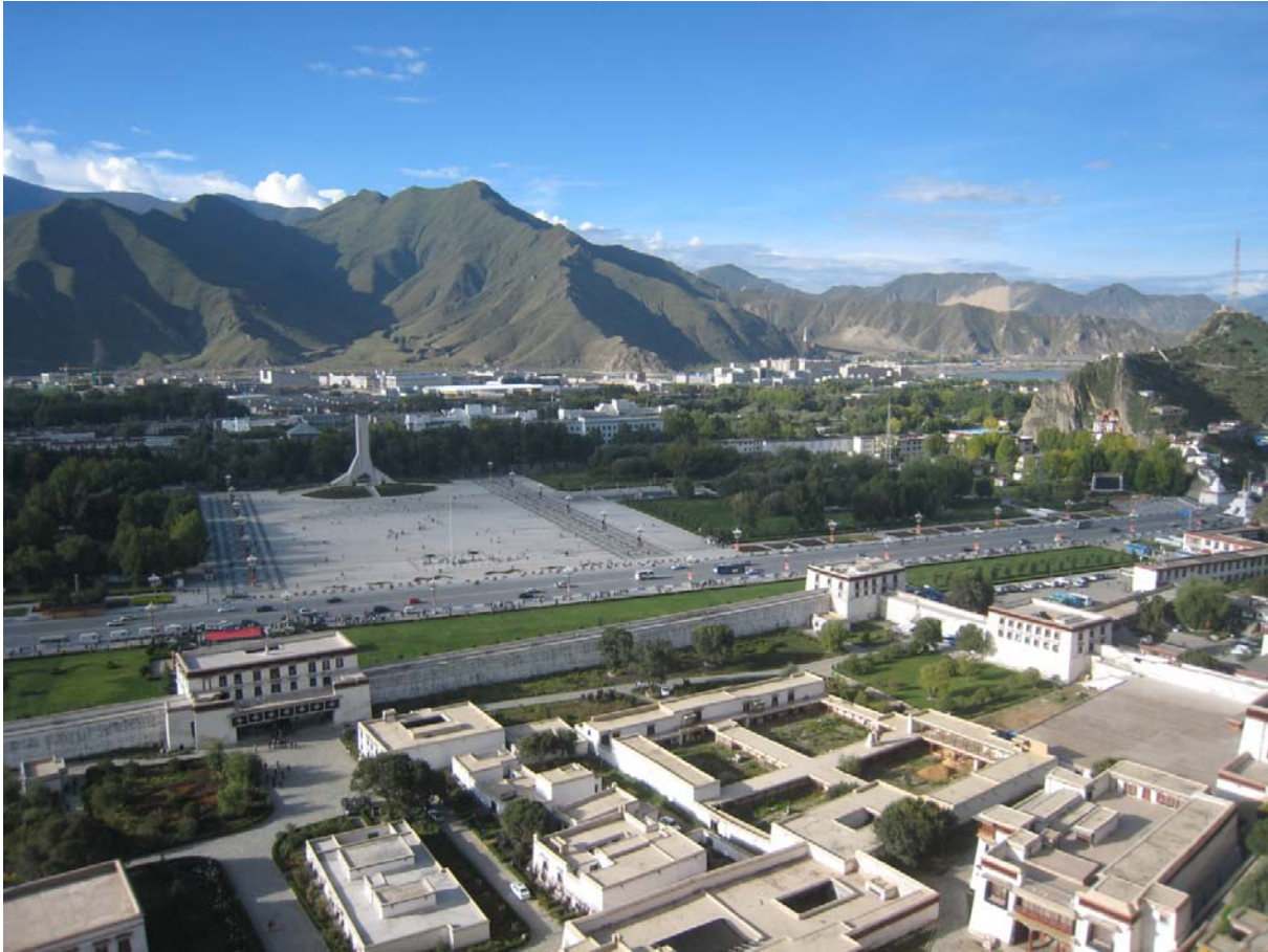
View from the Potala Palace shows railroad bridges and development in western Lhasa.

The central government's investment has not been limited only to the transportation sector. According to Chinese authorities, the government has completed 80% of roughly 225,000 units of "safe and comfortable" housing, designed ultimately to provide modern accommodations for 1.2 million Tibetans. The delegation was taken to one "model village" a short drive outside of Lhasa, where we were invited into an "average" residence that indeed proved to be "safe and comfortable." The Potemkin-like quality of the village – newly constructed in the past few months, with photos of Chinese leader Deng Xiao-ping prominently displayed on the wall, and the presence of a family patriarch whose life story (former serf, PLA soldier, and now a retired grandparent full of gratitude to the PRC) – was emblematic of the story that Beijing wants to tell in Tibet. Yet it could not diminish an important underlying truth: average Tibetans are better housed today than before. Moreover, Tibetans said they were grateful to have housing that is warm and has electric power, running water, and modern appliances. Members of the delegation were able to confirm both the extent of this massive housing initiative, and the generally appreciative Tibetan attitude about it, both in the TAR and in other Tibetan regions.