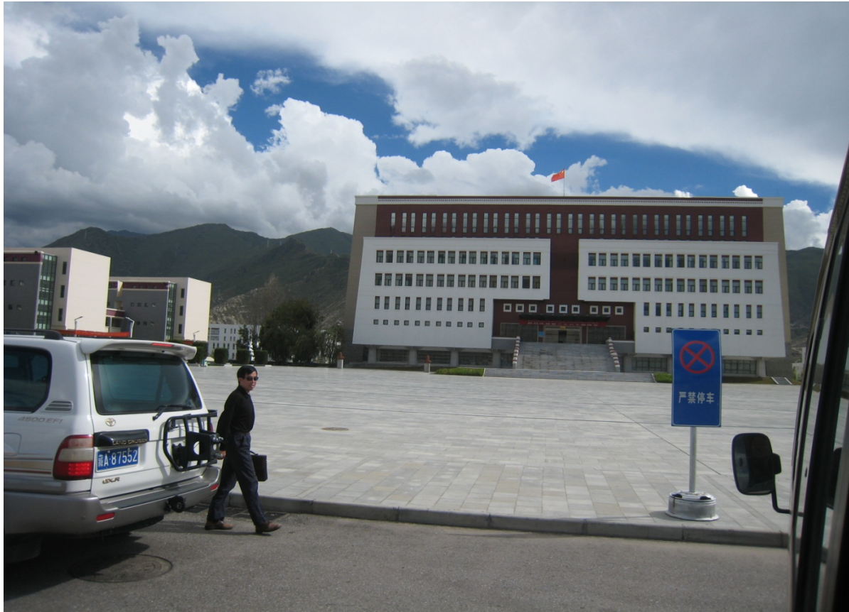
The newly completed Tibet University campus in Lhasa has an enrollment of 8,000 on a modern campus, helping to remedy a shortage of higher education opportunities inside the TAR.