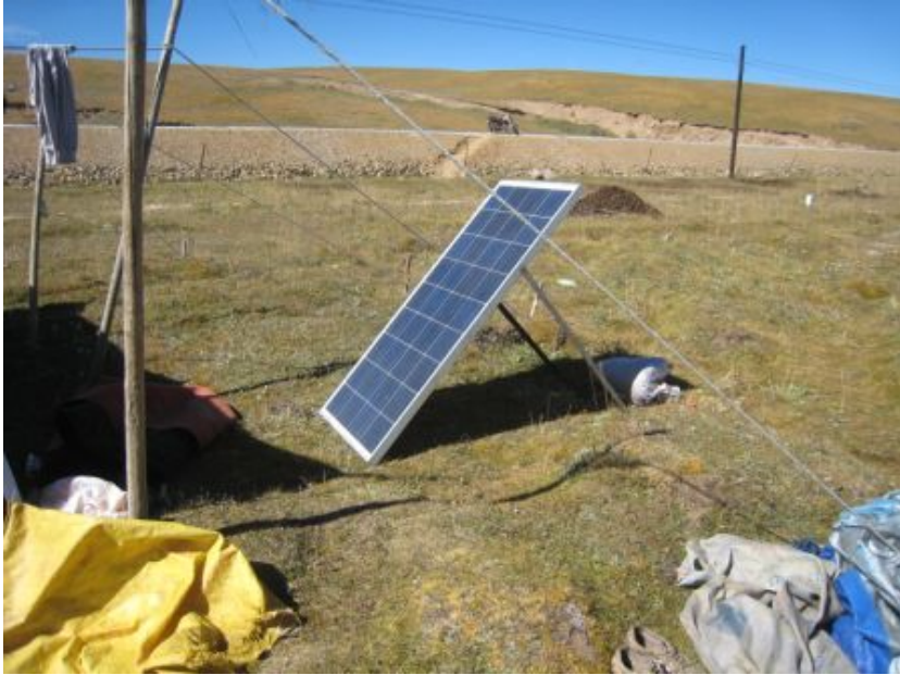
Mobile solar unit, costing $350, are found at most ger camps.

Throughout the region, we noted numerous road, housing, and hydropower projects. Particularly in the areas designated as Tibetan “autonomous” districts, the roads were new and remarkably well-maintained. National and local state-owned power companies were investing in a large number of new mini hydro-electric plants and small-scale solar energy plants designed to power local communities. Electricity and telephone wires stretched over 3700 meter high passes, and public electric power reached up valleys to lone permanent dwellings. All of the local monasteries visited were building new stupas, assembly halls, and residences.