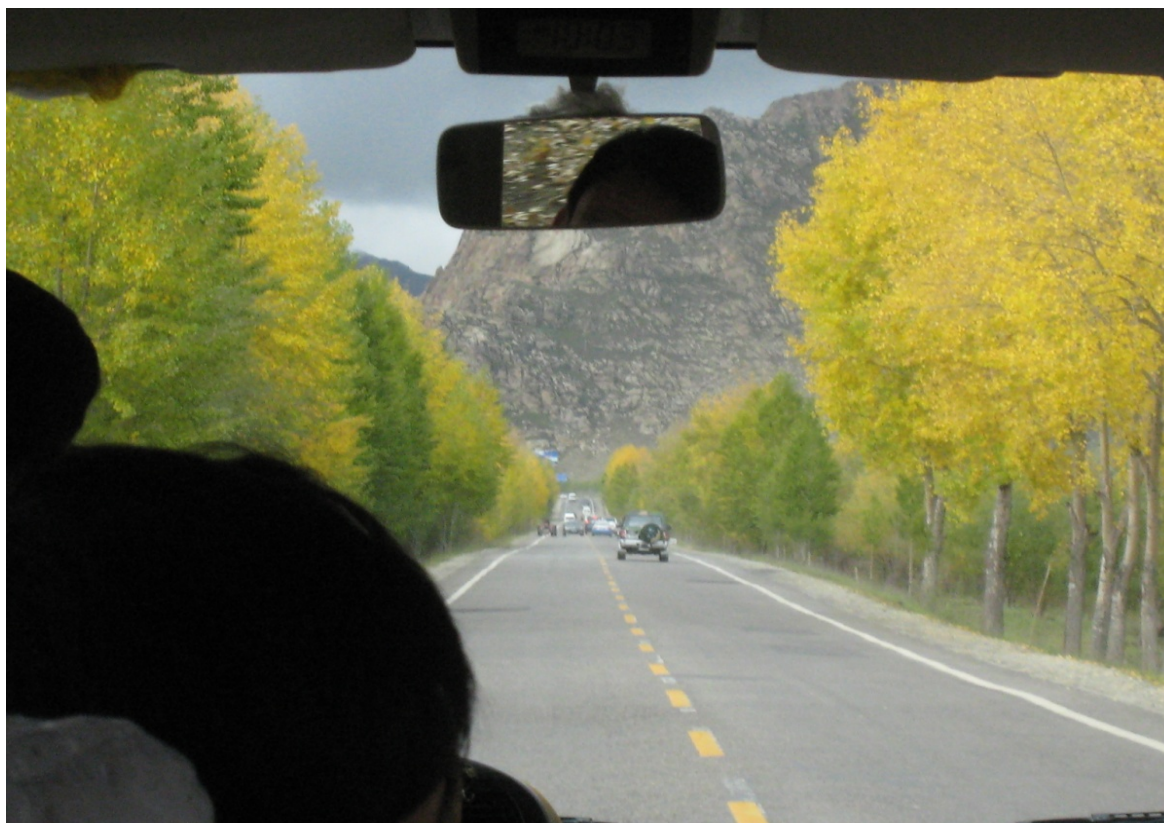
Modern two-lane highways now crisscross Tibet, cutting travel times from days to just hours.