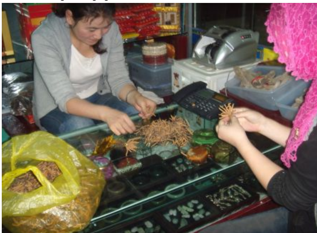
Hui girls sort caterpillar fungus in Xining. Girl on right is holding $100 worth in her hand.

The rising popularity and prices of a traditional Tibetan medicine called caterpillar fungus is also increasing the incomes of Tibetans living in some of the most isolated areas. The fungus, which grows on a caterpillar host and is only suitable for harvest during a few weeks in late spring on the Tibetan Plateau, is recognized internationally as a “natural Viagra.” Retail prices in Xining currently range up to RMB 150 (USD 22) per “stem,” and average about RMB 40 (USD 6) per small unit. A Tibetan economic development specialist told us that a good collector could gather at least 50 caterpillars per day at the height of the eight-week collecting period. He explained that this trade was providing important supplemental income for herders, who now often rent out “gathering rights” on their land.