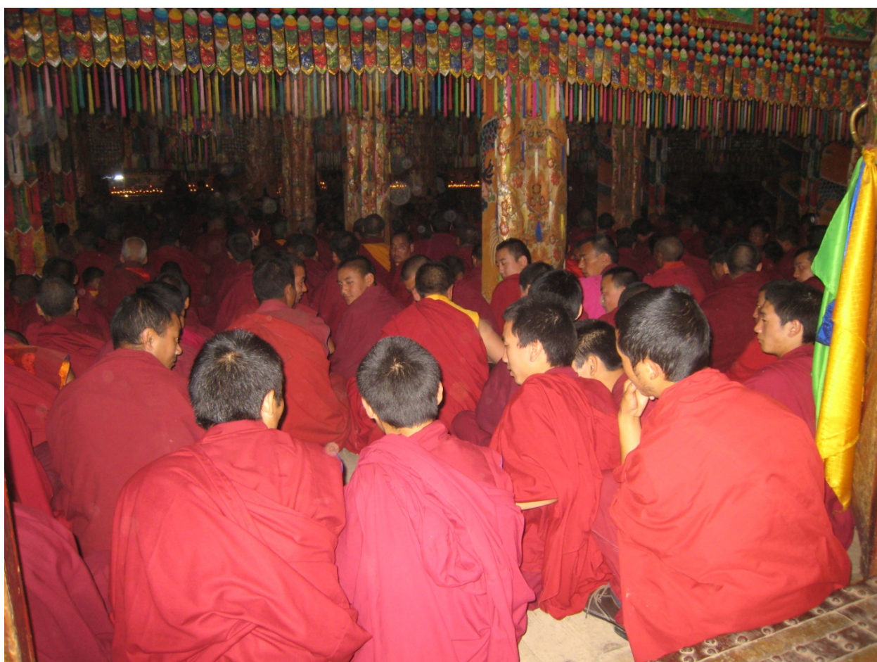
Thousands of monks gather in Rebgong for a celebration to dedicate a new privately financed stupa.

Nomads who were to receive new housing often greeted the news with enthusiasm. They already owned permanent winter houses in the mountain valleys, and liked the idea of virtually-free residences close to town. One nomad explained that his family planned to use the government-provided house for most of the family in the winter; only one man in the clan would stay in the old winter house to watch the livestock. When spring arrived, other members of the family would gradually return to the gors and their summer grazing lands in the mountains, leaving behind only the elderly and children still in school.