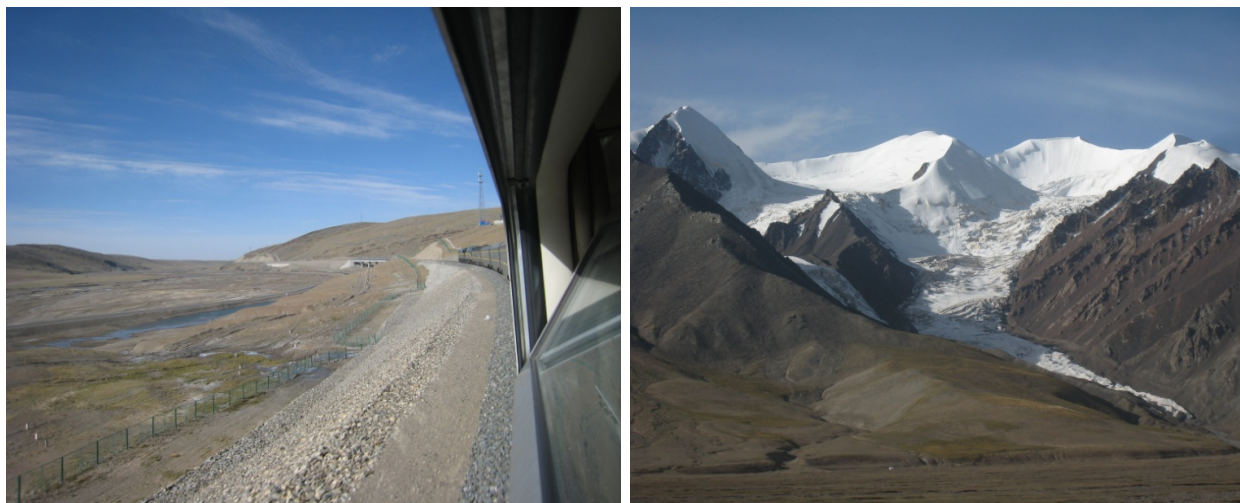
The Qinghai-Lhasa railroad crosses more than 700 miles of permafrost – a bleak and mostly deserted landscape, punctuated by dramatic glaciated peaks and the occasional mine or nomad camp.

authorities in the religious life of Tibetans, especially the heavy police presence in Lhasa since the riots of 2008 and the requirement for “patriot education” in monasteries. She expressed admiration for the Dalai Lama, and was aware of both his Nobel Peace Prize and his Congressional Gold Medal (an “award from the U.S. Government”), but expressed uncertainty about whether the Dalai Lama and Tibetans living in exile had a good grasp of conditions inside the TAR after so many years away. Her mixed views of the impact of modernity and Chinese rule in Tibet were typical of those expressed by many average Tibetans with whom staff members spoke during our visit.