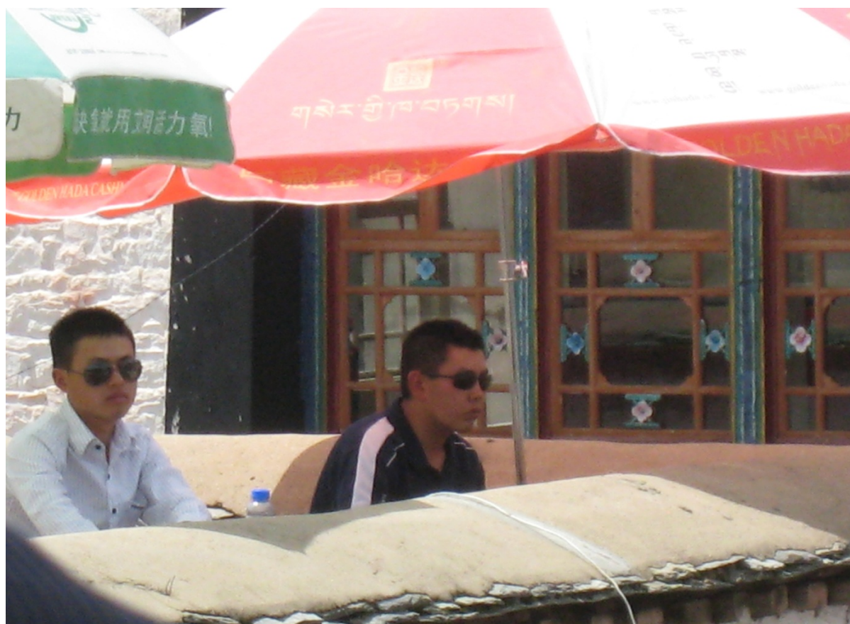
Plainclothes police sit atop many buildings in the Barkhor district of downtown Lhasa during daylight hours, alert for any public disturbance.