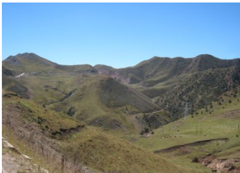
Power transmission lines cross mountain passes at altitudes in excess of 3,700 meters in Qinghai and Gansu Provinces.