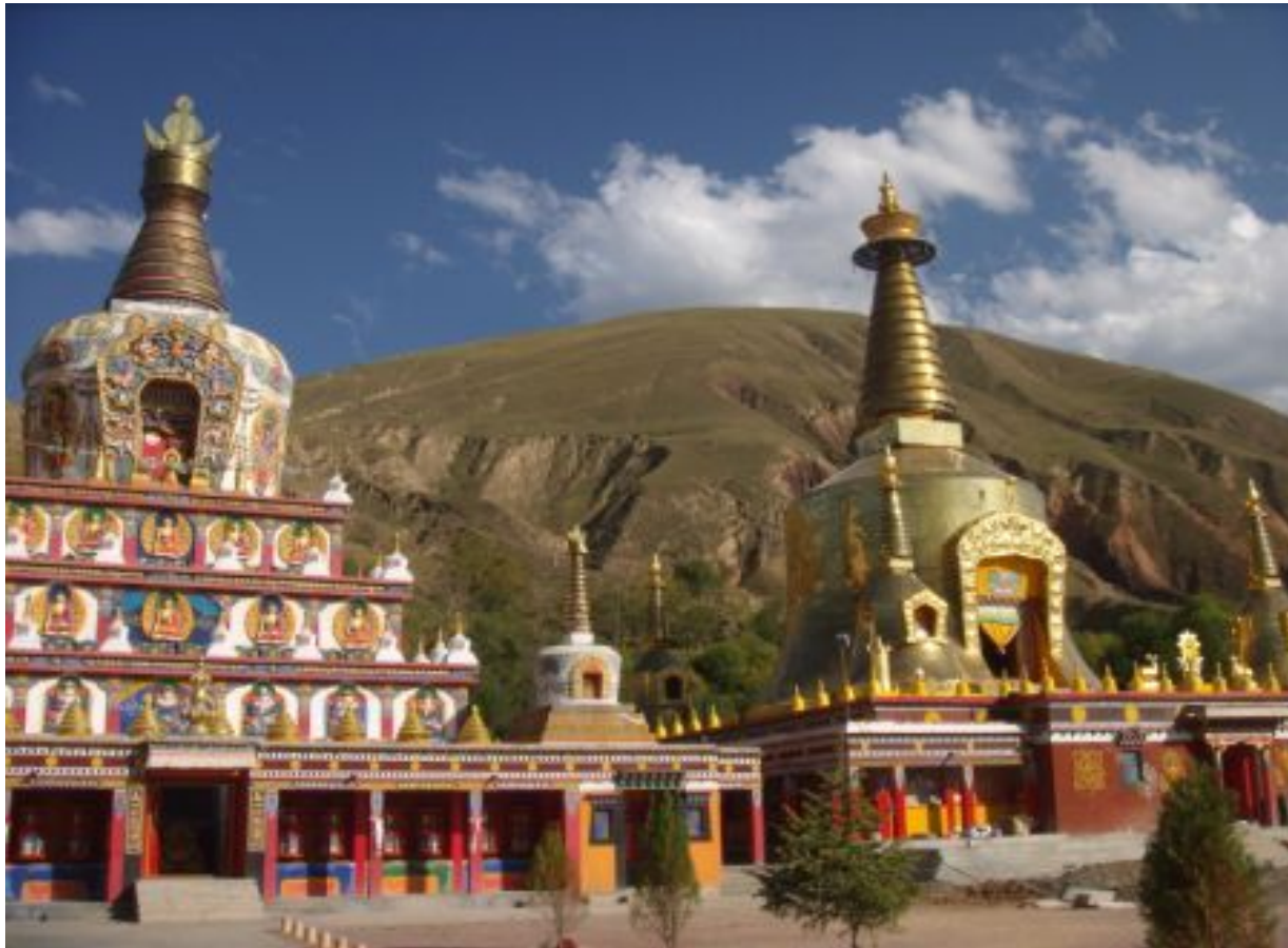
Privately-built stupas await dedication in Rebgong, Qinghai Province, center of Tibetan Buddhist art.

Religious tourism appears to constitute an important source of income in the towns surrounding important monasteries. Noting the large new stupas under construction, a monk at the Wudunsi Monastery in Qinghai stated that the money came from private donations, not government subsidies. Another monk at the Labrang monastery stated that monks were allowed to keep all of the proceeds from admissions tickets, and use them to repair and rebuild facilities. In the easier-to-reach monasteries within a day's trip of an airport, we encountered groups of well-off Buddhist pilgrims from Taiwan, Guangdong, and Japan.