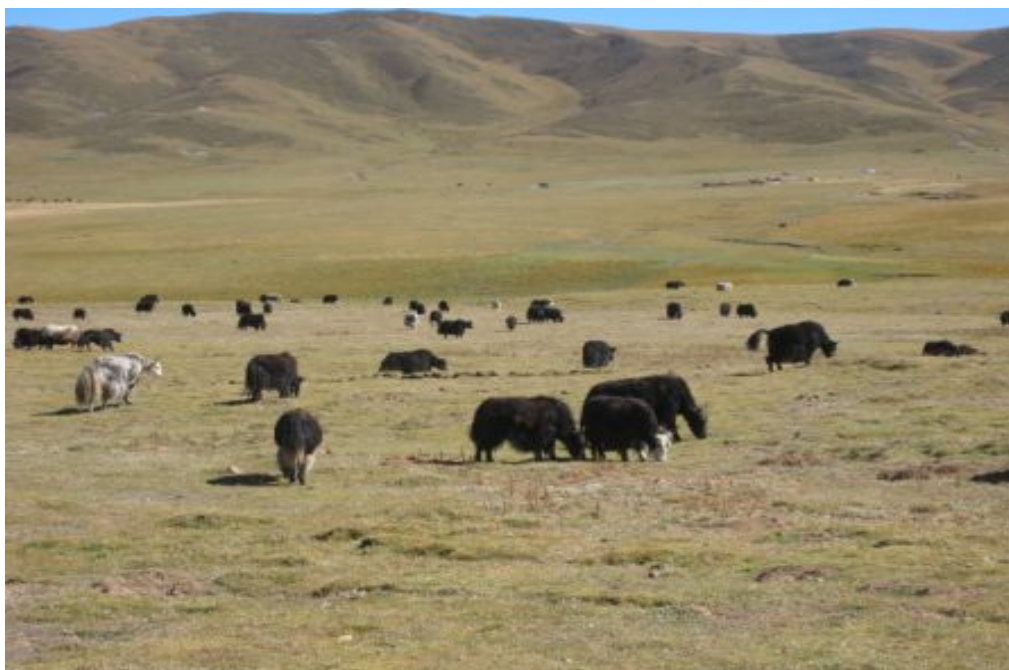
The average family has roughly 50 head of yak, enough to lift most out of poverty.

In general, Tibetans in Amdo still have very low incomes. Most are semi-nomadic herders or subsistence farmers supplementing their incomes in the winter with manual labor or simple services jobs in small market or monastery towns. They are, however, enjoying some of the benefits of economic development and increased government spending. A monk at the large Labrang Monastery in Gansu explained that the monastery supports monks and students from families that are too poor to provide basic subsistence funds, but in recent years such community support was almost completely unnecessary since all of the surrounding nomad families “were not rich, but no longer poor.”