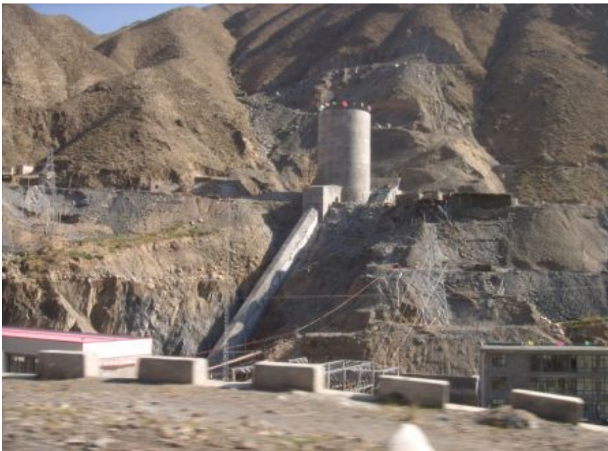
New mini-hydro power plants abound in western Qinghai and Gansu.

Throughout the region, we noted numerous road, housing, and hydropower projects. Particularly in the areas designated as Tibetan “autonomous” districts, the roads were new and remarkably well-maintained. National and local state-owned power companies were investing in a large number of new mini hydro-electric plants and small-scale solar energy plants designed to power local communities. Electricity and telephone wires stretched over 3700 meter high passes, and public electric power reached up valleys to lone permanent dwellings. All of the local monasteries visited were building new stupas, assembly halls, and residences.