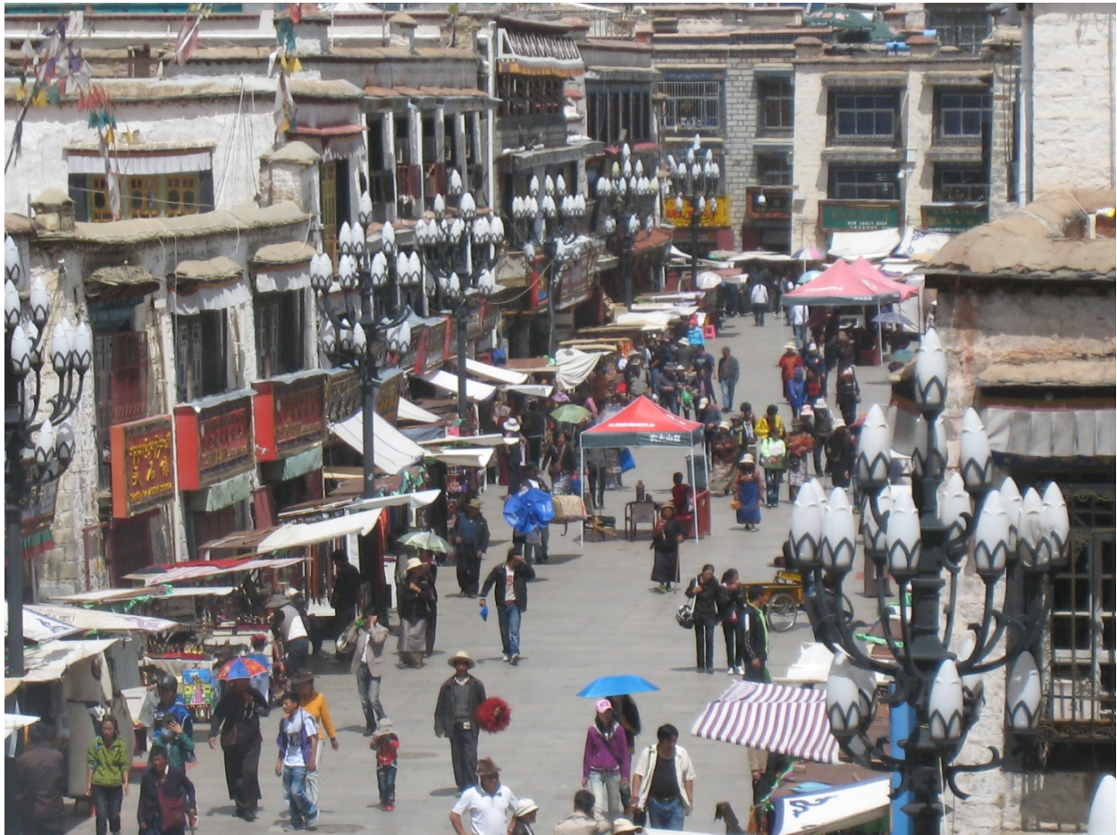
Pilgrims and tourists circumambulate clockwise around the Jokhang Temple, Tibetan Buddhism's most holy shrine, passing numerous small stalls selling souvenirs and handicrafts.

The staff delegation urged the Chinese government to engage in a sincere dialogue with Tibetans in exile, and we attempted to correct some misimpressions we heard while in Tibet. We were told, for instance, the following: that the Dalai Lama does not acknowledge improvements in living standards for Tibetans (false); and that the Dalai Lama does not acknowledge that Tibet is a part of China (also false). Even as the United States encourages reconciliation talks between the Dalai Lama and Beijing, however, we believe that Washington should take steps to establish joint projects. These should draw on the expertise of many parties, including even Tibetans in exile, and promote a better life for Tibetans inside China. These projects could themselves facilitate the dialogue and reconciliation process by expanding trust and demonstrating the value of tapping into outside expertise to address some of the myriad challenges confronting Tibet.