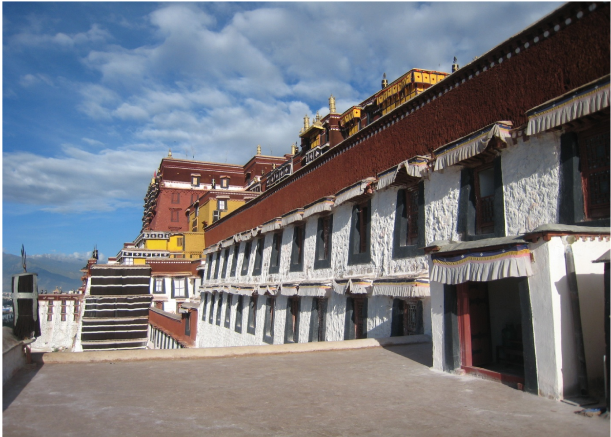
The restored Potala Palace in central Lhasa, the historical official residence for the Dalai Lama, draws hundreds of thousands of tourists and pilgrims each year.

This bipartisan report from the staff of the Senate Foreign Relations Committee presents our findings from a visit to Tibet from September 7-19, 2010. Four staff members of the Senate Foreign Relations Committee, accompanied by officials from the U.S. Embassy in Beijing, traveled to the Tibet Autonomous Region (TAR) and Tibetan regions of Western China. It was the first trip to Tibet by SFRC staff since August, 2002, when a seven person delegation traveled for 17 days in the TAR, Qinghai Province, and Gansu Province. The delegation was the first Senate staff delegation permitted by Chinese authorities to travel to Tibet since large-scale peaceful protests and some riots shook the region in March 2008. While our delegation was in Lhasa, the Chinese granted formal approval for U.S. Ambassador Jon Huntsman to visit Tibet. His request had been pending for several weeks. Ambassador Huntsman traveled to Lhasa and to Yushu County, in Qinghai Province, in late September.