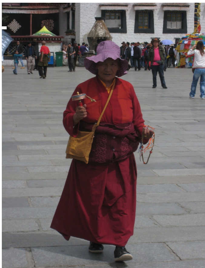
Tibetan pilgrim with prayer wheel in front of the Jokhang Temple in Lhasa. No evidence remains of the riots that scarred this plaza in the spring of 2008.

Chinese authorities clearly remain concerned about the possibility of a resurgence of social unrest in Tibet, and seek to insulate visitors from encounters that might tarnish the image of an idyllic, modernizing Tibet. In Tibet, unlike in most other parts of China, foreign tourists must be part of a “tour group.” Independent tourism remains prohibited. And all official visits to the TAR are carefully scripted by Chinese authorities to emphasize the positive aspects of