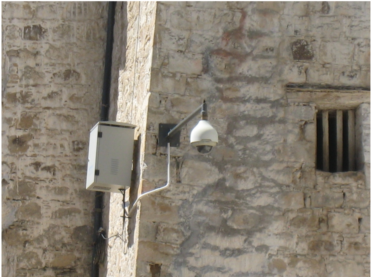
Police video cameras, such as this one at Sera Monastery, adorn most of the cultural sites of significance around Lhasa, but are rarely seen at Tibetan monasteries outside the TAR.

police are not around. The government prohibits young boys and girls, those under the age of 18, from becoming novices at monasteries and nunneries, although again, the rules are applied with varying degrees of rigor in different regions. The government limits the number of monks who can be in residence at large monasteries by establishing a quota, and at times restricts the freedom of movement of religious leaders. At all major monasteries, the government has set up a “democratic management committee” to ensure compliance with all applicable regulations. In some monasteries, particularly in and around Lhasa, the government has installed video surveillance equipment. In some cases, the government has built police stations adjacent to monasteries. Taken together, these rules and restrictions breed resentment and interfere with the ability of Tibetan Buddhists to enjoy that full measure of religious freedom promised them under Article 36 of China’s constitution and called for by international norms that China has at least nominally pledged to respect.