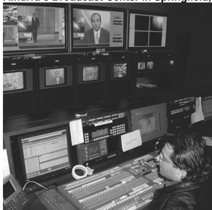
Alhurra's Broadcast Center in Springfield, Virginia

In response to our recommendations on the Board's strategic planning and performance management efforts, the Board revised its strategic plan to make reaching large audiences in strategic markets the centerpiece of its performance reporting system. The Board also added broadcaster credibility and audience awareness to its array of performance measures and plans to add a measure of whether VOA is meeting its mandated mission.