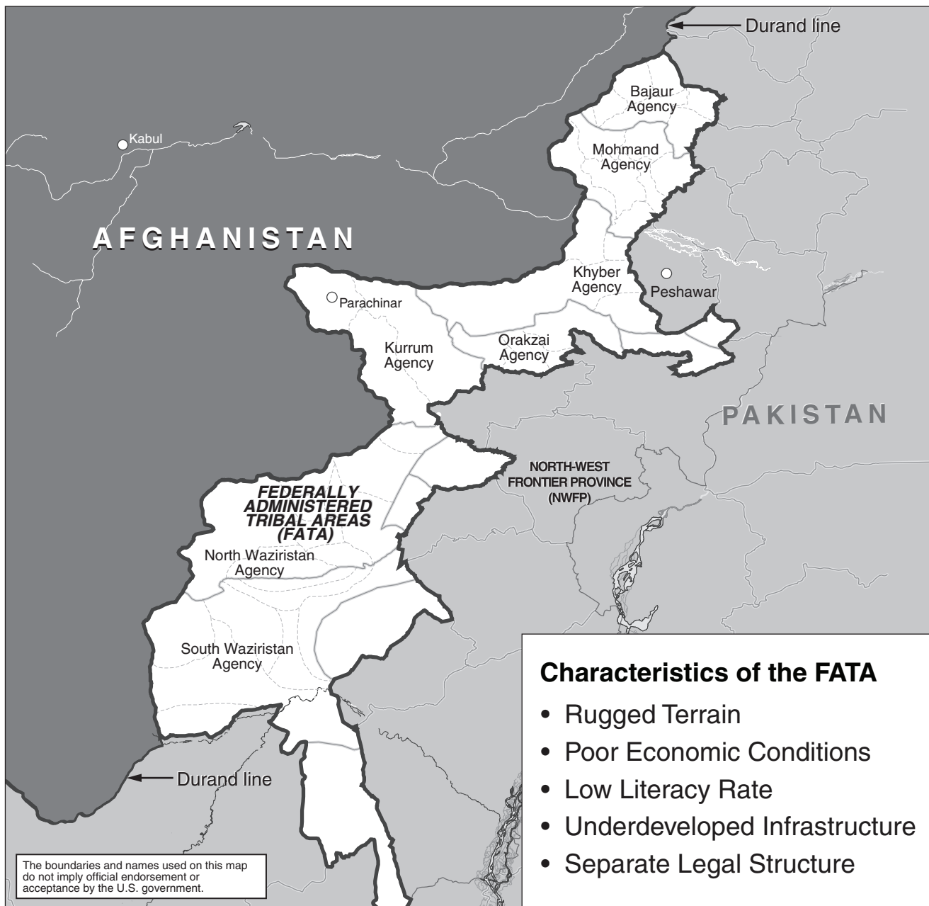
Figure 1: Map of the Federally Administered Tribal Areas, Pakistan