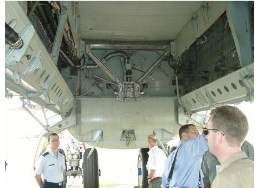
Mock Inspection – Barksdale AFB