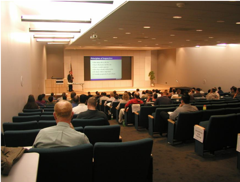
START Treaty Course