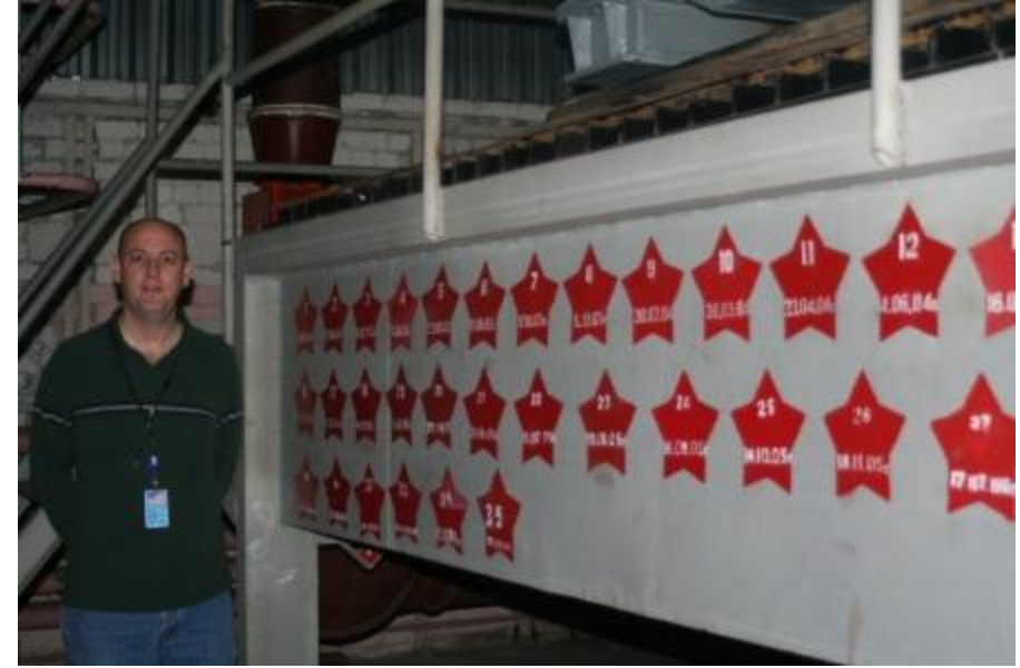
US START Inspector - Final Inspection at Bryansk Elimination Facility