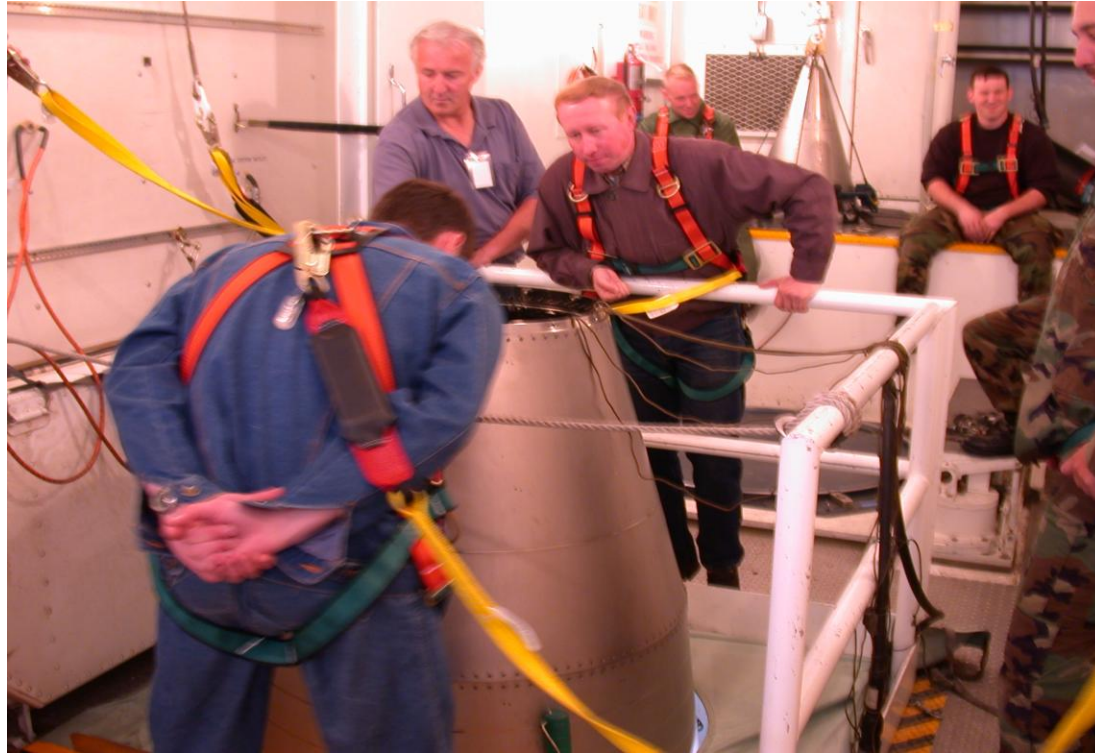
Russian START Team Inspecting a Minuteman III ICBM

Escorts Oversee Strict Compliance with Safety and Security Requirements