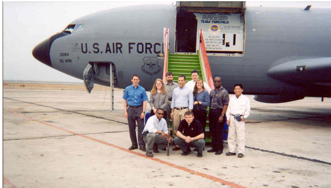
US START Inspection Team at Ulan Ude (Eastern Russia Point of Entry)

Short-Notice Inspections Ensure Treaty Compliance