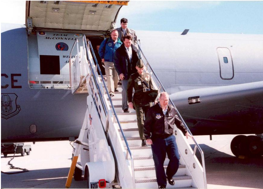
Russian START Inspectors Arrival