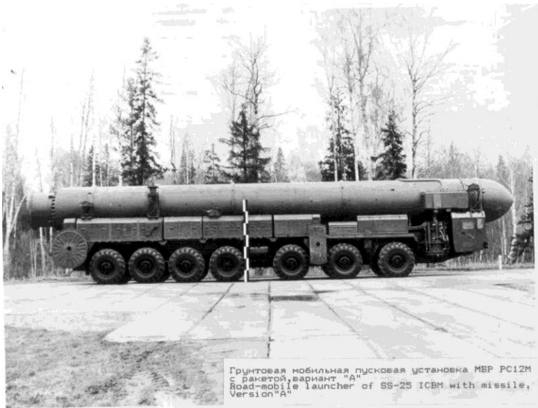
SS-25 Mobile ICBM