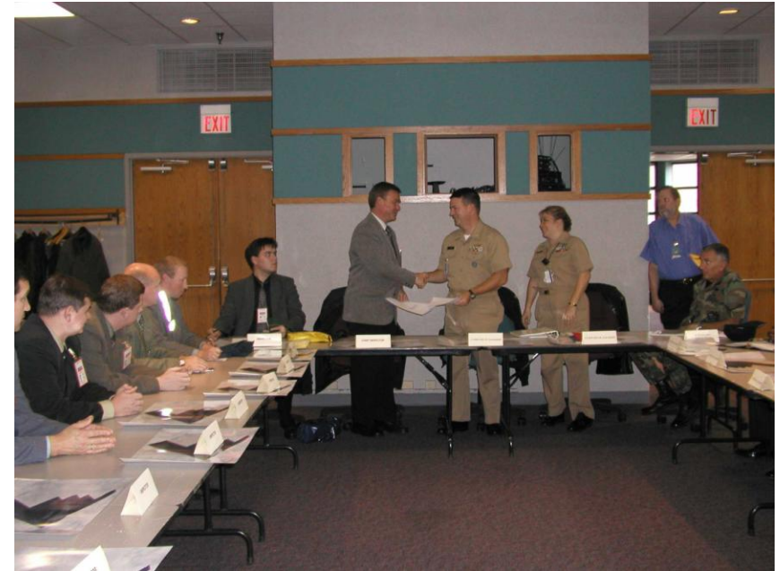
Russian Inspectors Designate Inspection Site

Inspectors Arrive at the Right Place at the Right Time