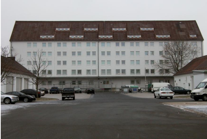
Western Gateway – Darmstadt, Germany