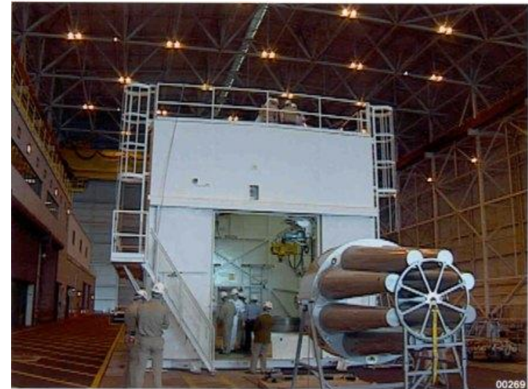
SLBM Warhead Cover

Coordination with Site Personnel is Key to Successful Inspection