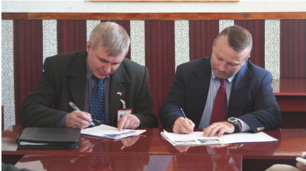
US and Russian Team Chiefs Signing Inspection Report

Inspection Reports Provide Factual Accounts of What Occurred On-Site