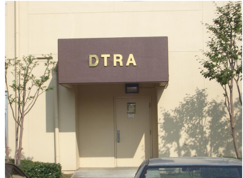
Eastern Gateway - Yokota AB, Japan

Gateways Are Key to Successful Mission Planning