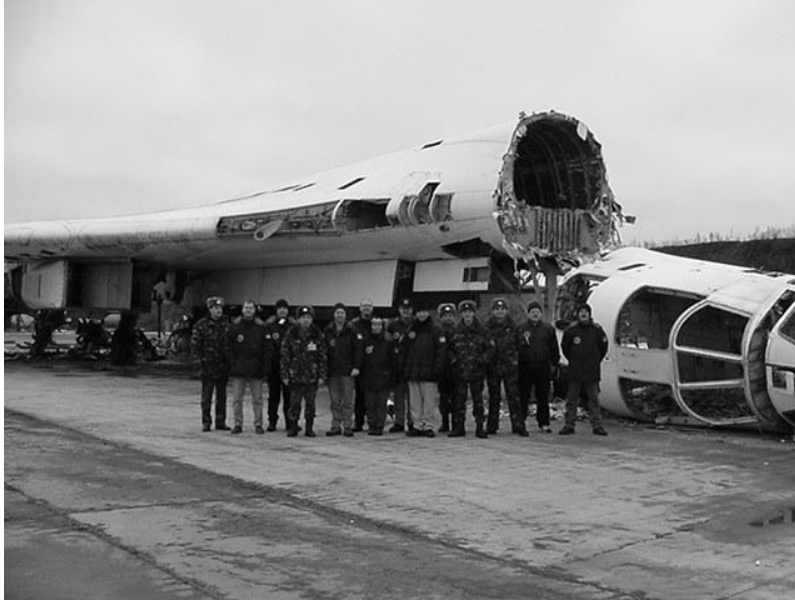
Blackjack Heavy Bomber Elimination Inspection