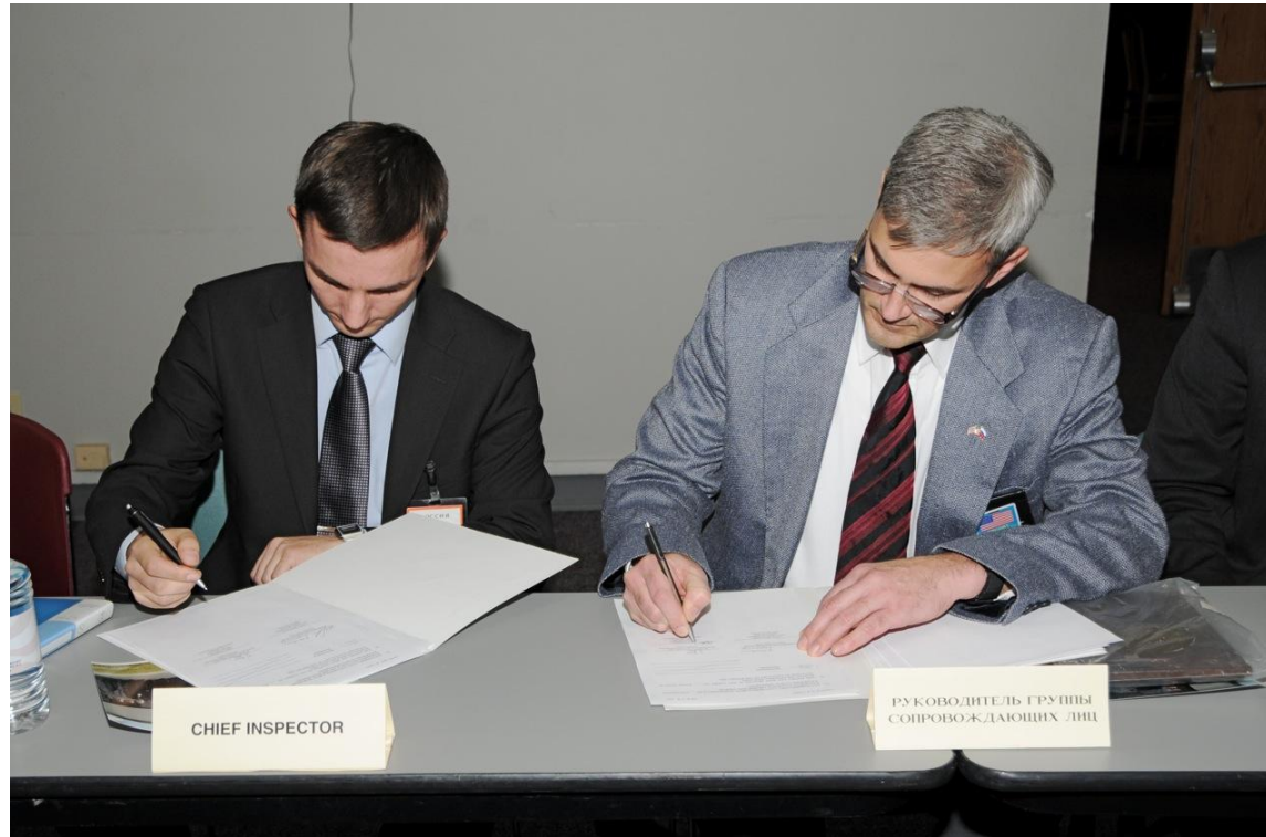
Inspection Report Signing Ceremony

DTRA Escorts Ensure Treaty Requirements Are Met