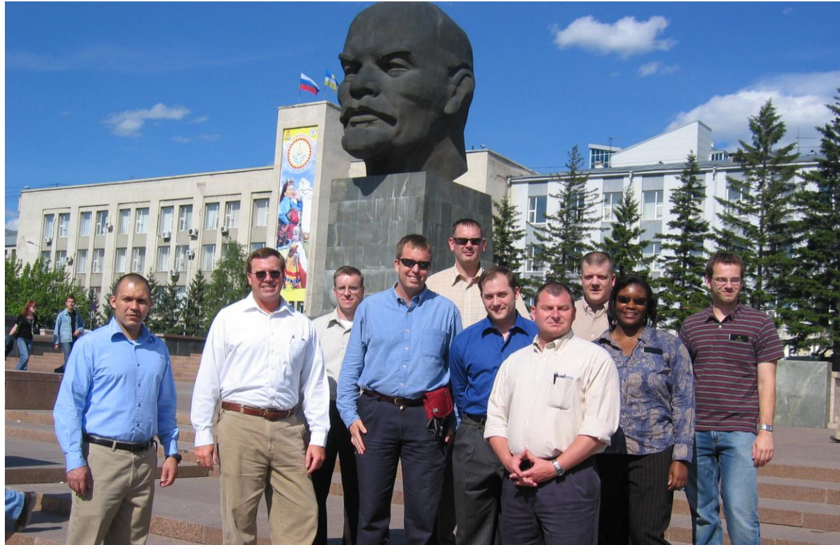
US START Inspection Team in Eastern Russia

US Teams Bring Wide Range of Expertise to Inspections