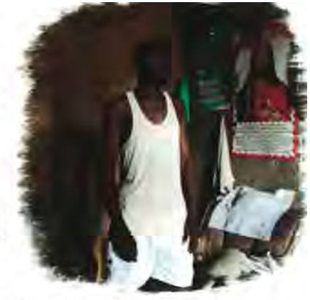
A midder as home in his barracks, Katinda Camp, Gama-

45. The EUSEC project on reform of the Congolese military demonstrates that structural reform need not be expensive if support is correctly targeted. EUSEC was launched in 2005 and embedded small numbers of European officers at senior levels in both headquarters and with individual units. Designed to offer strategic advice and targeted support, its most significant initiatives have been working on the 'chain of payment' –