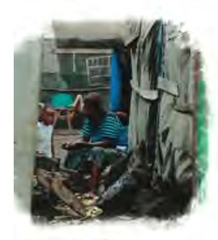
A military family living in Camp Katinsis. North Kivy, Most families in the spressing army camp live in tents or makeshift structures.

24. Regional organizations, most importantly the African Union (AU) and the Southern Africa Development Committee (SADC) have a pressing and legitimate interest in regional prosperity and stability, And the international financial institutions – frequently cited as the actors with the most significant leverage and access in Kinshasa<sup>11</sup>- are committed to helping the DRC achieve sustained economic growth. The IMF is the only actor currently providing direct budget support to the DRC government<sup>12</sup>.