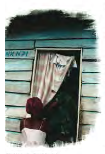
Officers' Quarters at Comp Ratindo in Gome, North Kiva province. Originally Intended to Bouse 160 prople, the camp is now home to more than 36,000 prople, the camp is now home to more than 36,000 prople. Including many soldings' families.

6. Yet despite this consensus, military reform efforts have failed, both during the transition and afterwards. They have failed for two primary reasons. The first is the lack of political will on the part of the Congolese government; the second inadequate and poorly coordinated assistance from the donor community.