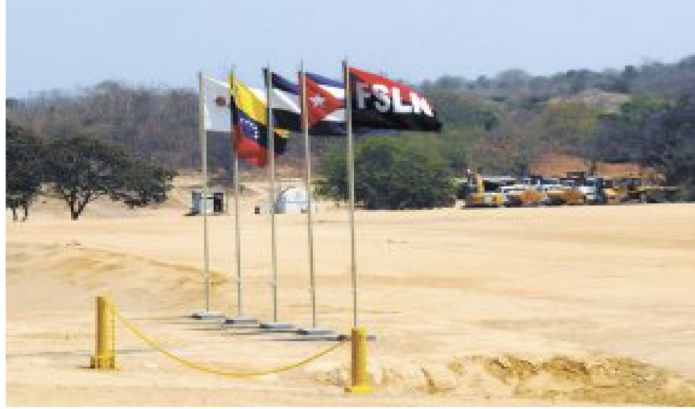
Figure 3: The empty field where $237.2 million have reportedly been spent over the past five years to build an as-yet invisible oil refinery.

These last few cases, though far afield from Venezuela, constitute a key part of Venezuela's reach across the hemisphere and its ability to create corrupt structures, move well over $1 billion a year in unaccounted funds, and support criminal and terrorist organizations. These massive financial flows serve to corrupt the state, shield officials from accountability, create enormous "slush funds" for the governments to act without transparency, and are undermine the rule of law. They may also be of significant aid to drug trafficking and terrorist organizations.