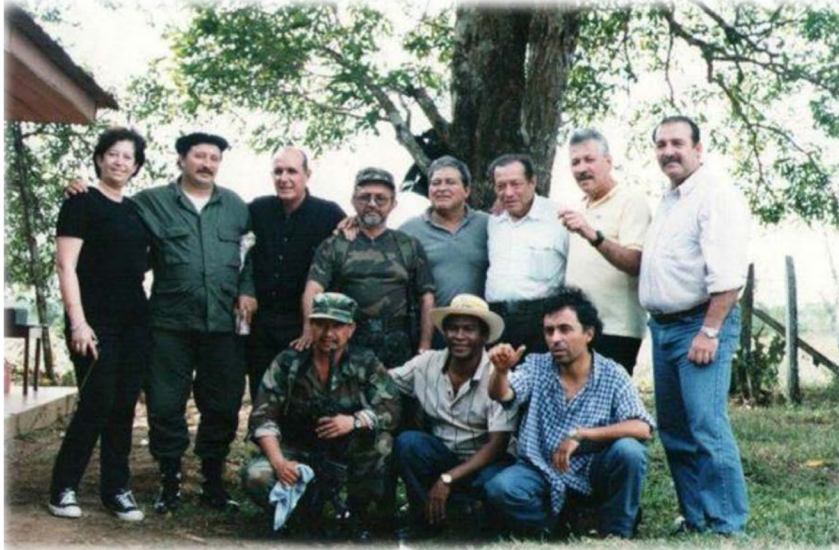
Figure 2: Salvadoran President Salvador Sánchez Cerén (center) with FARC leader Manuel Marulanda (immediate left) and Raúl Reyes (immediate left, in camouflage) at a FARC camp in 2001.