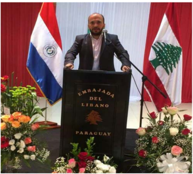
test of honor and featured speaker at the November 2016 Embassy of Lebanon Independence Day reception in Asuncion.<sup>74</sup>

In November 2016, the Lebanese embassy in Asuncion hosted him as a featured speaker at the embassy reception marking Lebanon's Independence Day. ^{73}