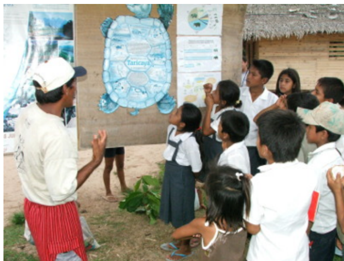
Schoolchildren learn about wildlife in Peru's Cordillera Azul National Park.

In contrast to the park, the buffer zone contains about 180,000 people living in more than 200 communities, including 15 indigenous communities. Migration and disorganized settlement is putting pressure on forest resources, especially by those engaged in coca cultivation, illicit land purchases, illegal logging, and unregulated hunting