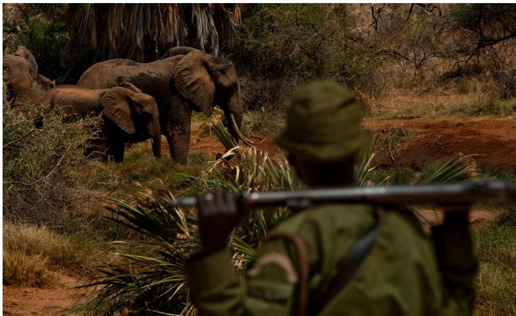
A community ranger observes a family of elephants.

approach to community-led conservation. Today, there are 26 community conservancies under NRT's umbrella, covering 3.6 million acres of Kenya's arid northern rangelands. These are bringing greater security and peace, improving livestock productivity, creating jobs, and conserving wildlife in areas that have historically been marginalized and impoverished.