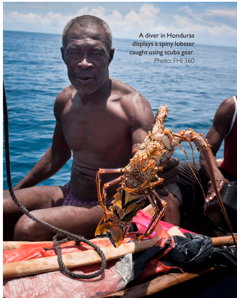
A diver in Honduras displays a spiny lobster caught using scuba gear.

G-FISH launched the Spiny Lobster Initiative (SLI) in 2009 with the goal of reforming a particularly dangerous lobster fishery to make it safer and more sustainable. Growing government consensus on spiny lobster management but limited consultation with industry and communities made SLI particularly timely. The biggest changes to the fishery were initiated in March 2009, when the regional fisheries and aquaculture organization established an annual closure on lobster fishing during the four-month reproductive period. The organization also called for a regional ban on industrial scuba-dive fishing to begin in 2011, due to the