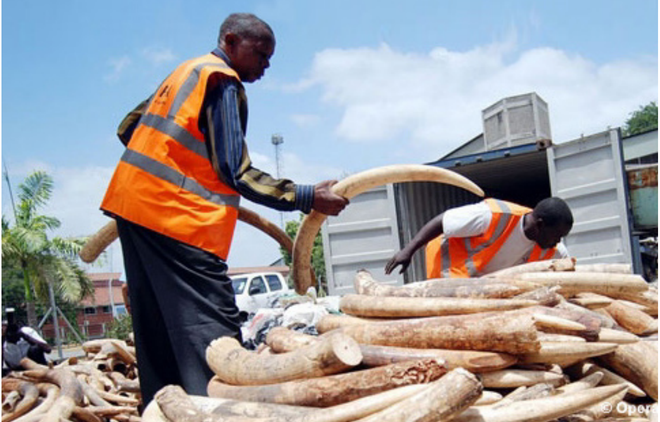
Inspectors sort Ivory confiscated in January 2013.

Agency CITES Enforcement Collaboration Group and ASEAN-WEN planned the collaborative action now known as Operation Cobra. Drawing on the expertise of partners such as World Customs Organization and the UN Office on Drugs and Crime, as well as several years of wildlife crime information collected by FREELAND, an international coordination team in Bangkok supported real time information sharing among participating law enforcement agencies and across borders. Cobra focused on the quality of investigations over the quantity of seizures, promoting specialized techniques that allowed several follow-up investigations into seizures of contraband.