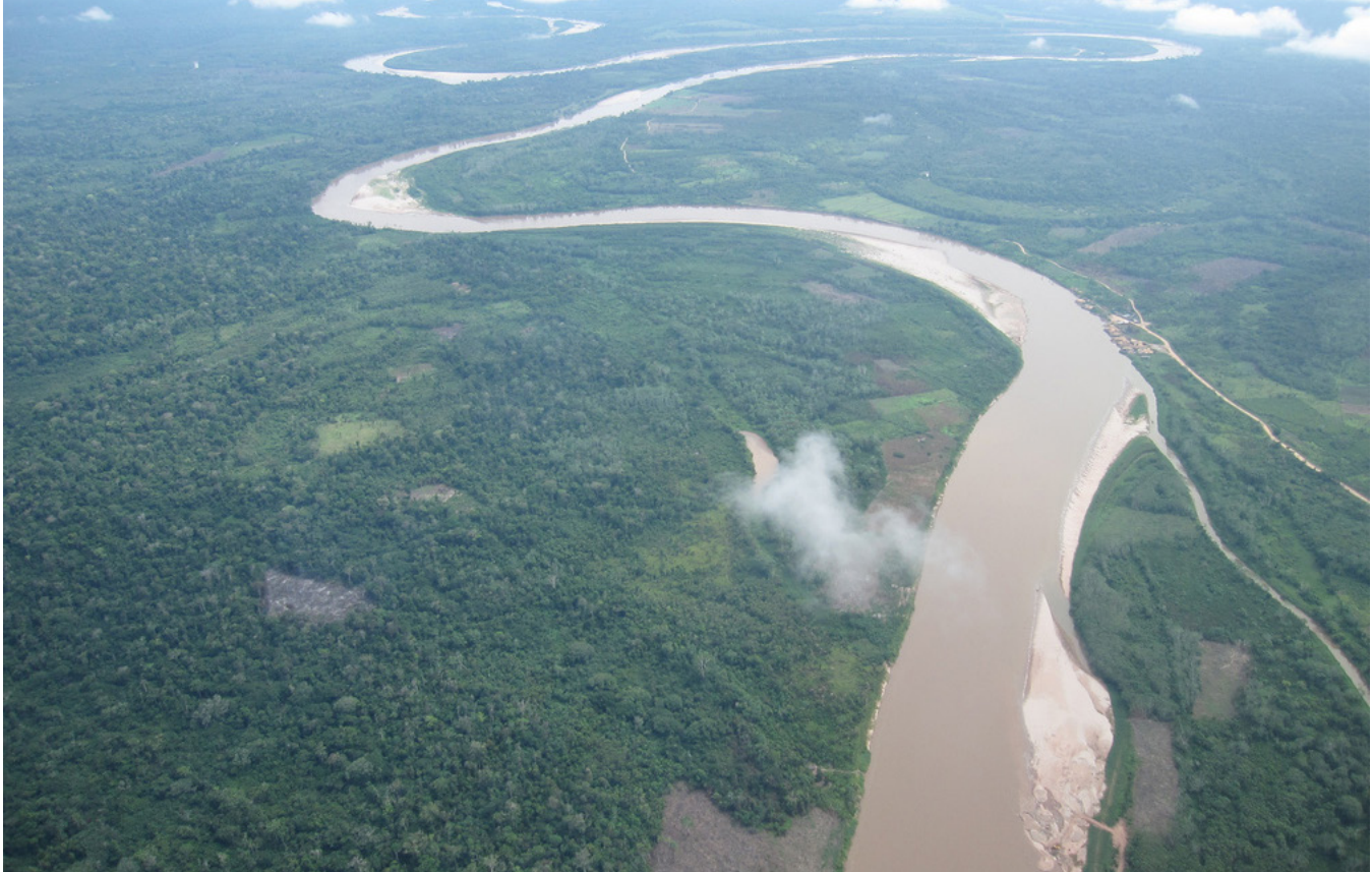
Cordillera Azul from the sky.

and fishing. The rate of deforestation in the buffer zone is 1.6 percent annually, with 440,000 hectares of forest lost between 1999 and 2010.