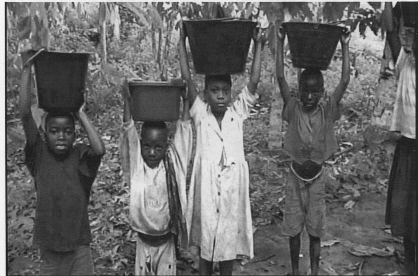
Children of Nkoltara village, October 2005