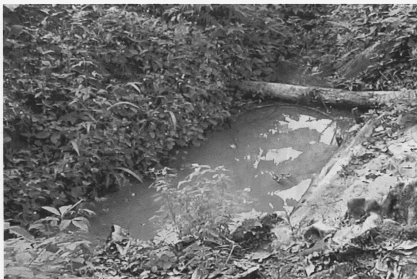
The polluted well of Nkoltara village located near the pipeline, October 2005.