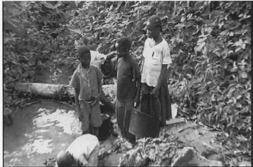
Children of Nkoltara village, October 2005