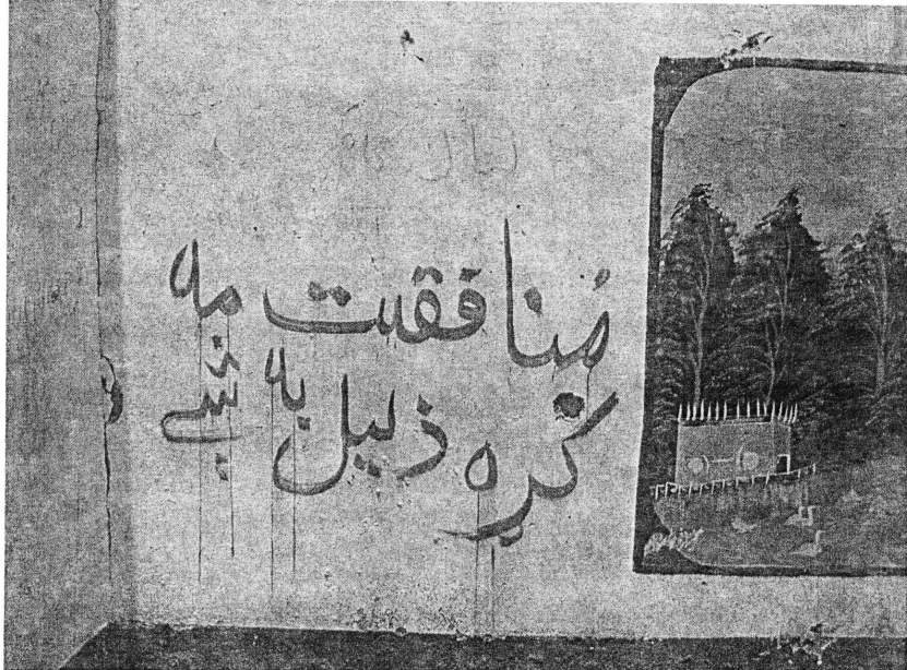
Figure 4. Anti-Munafiqat graffiti from the Pakistan Taliban in South Waziristan

This Pashto caption translates as “Don’t indulge in munafiqat (hypocrisy) or you will be debased.” This inscription is believed to be written in blood by the Pakistan army, but the author cannot confirm this claim.