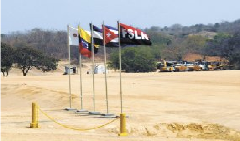
Figure 3: The empty field where $237.2 million have reportedly been spent over the past five years to build an as-yet invisible oil refinery.

Yet all that is visible of the $237.2 million dollar investment is an empty field of compact earth with the flagstuffs bearing the flags of Nicaragua, Venezuela, Cuba and ALBA. Construction machinery has remained idle at the site for three years. 40