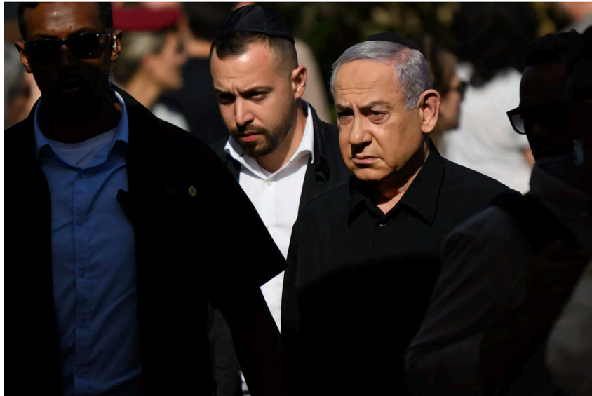
Prime Minister Benjamin Netanyahu's critics disparage the payments as "buying quiet."

The official in the prime minister's office said Mr. Netanyahu never made this statement. But the prime minister would articulate this idea to others over the years.