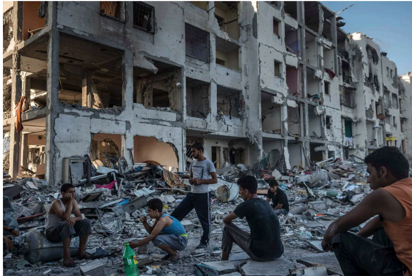
Residents in 2014 outside their destroyed homes in Beit Lahia, in the Gaza Strip.

Exactly how Israeli intelligence obtained the ledgers — whether from an informant or a computer hack — remains unclear. But in 2018, the team got the proof it had been seeking.