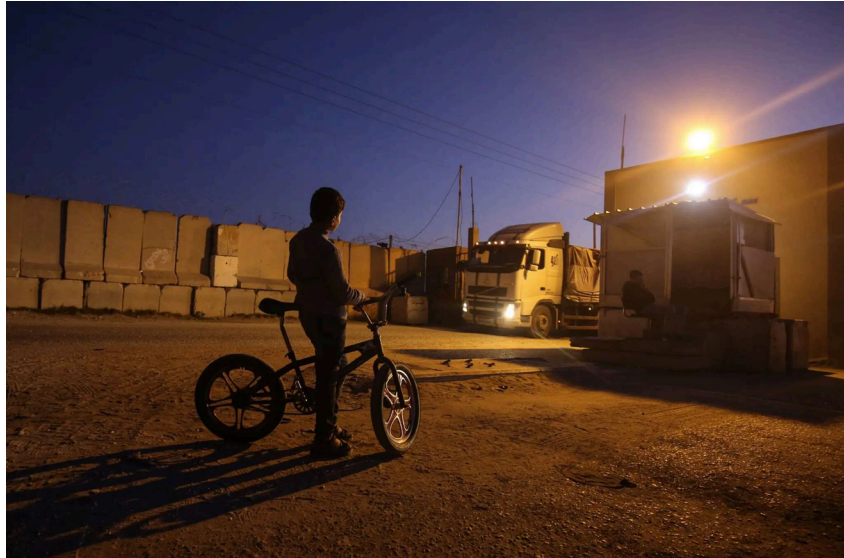
Vehicles donated by Qatar to the civil defense and fire brigade crossing through the Kerem Shalom border crossing into Gaza in 2019.