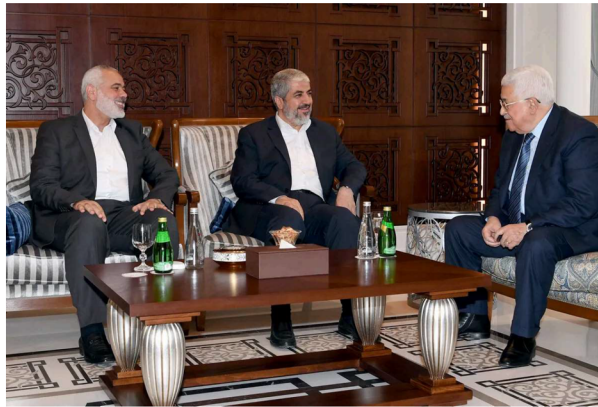
Palestinian President Mahmoud Abbas meets with the Chairman of the Hamas Political Bureau, Khaled Mashal and the vice Chairman of the Hamas Political Bureau, Ismail Haniyeh in Doha, Qatar on October 28, 2016.