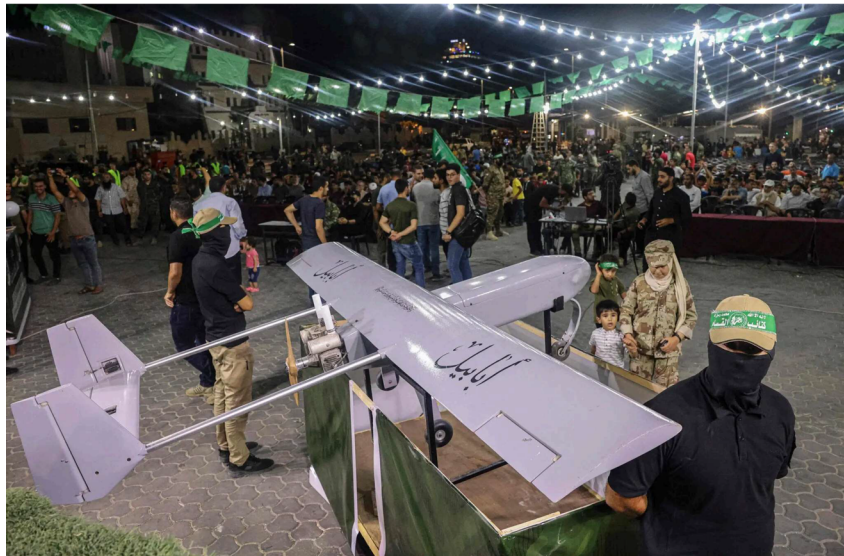
Members of the Qassam Brigades, Hamas’s military wing, next to a model of an Ababil drone in 2022 during a rally in Khan Younis, in the southern Gaza Strip.

Former Harpoon agents grew so frustrated with the inaction that they uploaded some documents to Facebook, hoping that companies and investors would find them and stop doing business with Hamas-linked companies.