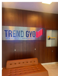
The Trend GYO headquarters in Istanbul.

The goal was to create a trail of online breadcrumbs for journalists, financial investigators and others to follow. The Facebook post generated a smattering of news coverage.