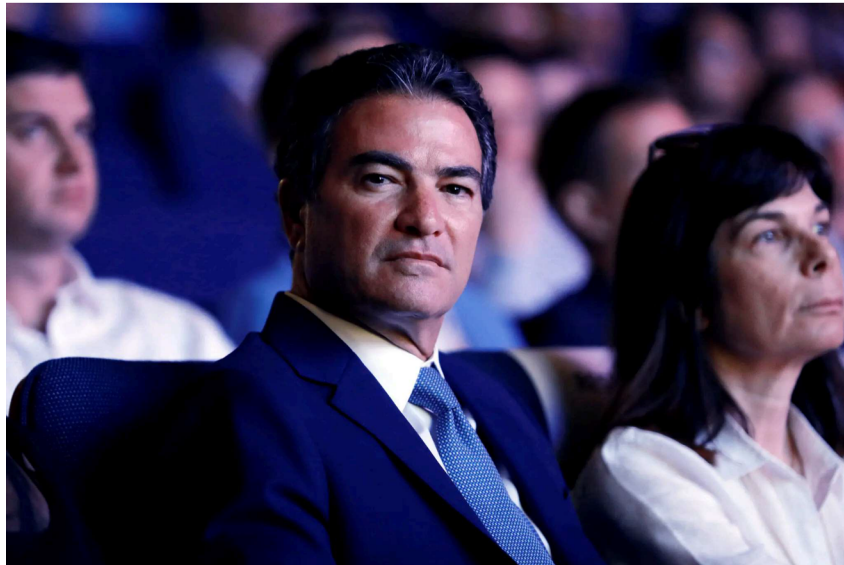
Yossi Cohen in 2019 in Tel Aviv. As chief of Mossad in 2016, he dismantled Harpoon.