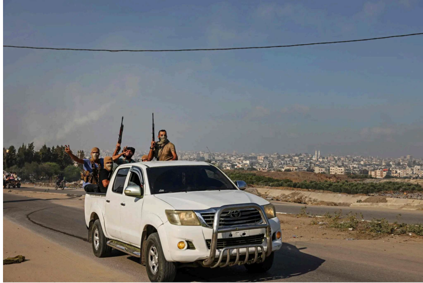
Fighters from the Ezzedine al-Qassam Brigades, Hamas's military wing, moving toward the Erez crossing between Israel and the northern Gaza Strip on Oct. 7.