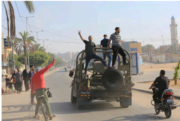
Palestinians ride on an Israeli military vehicle taken by Hamas militants during its coordinated attack on October 7, near the Gaza Strip fence.

At the time, Netanyahu leaked to the media the contents of a presentation that the military had made to the security cabinet laying out the potential repercussions of conquering Gaza. The premier knew that the secret document, which noted that occupying Gaza would cost the lives of hundreds of soldiers, would create an atmosphere of opposition to a widespread ground invasion.