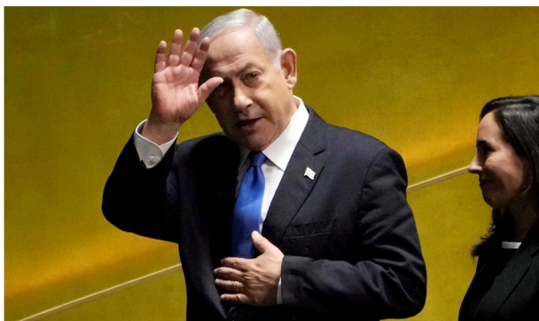
Benjamin Netanyahu. "The pogrom of October 7, 2023, helps Netanyahu, and not for the first time, to preserve his rule."