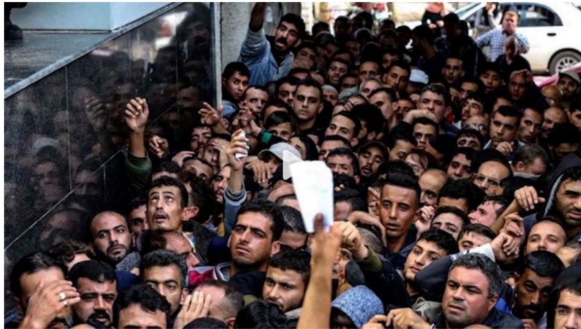
Video Ad Feedback