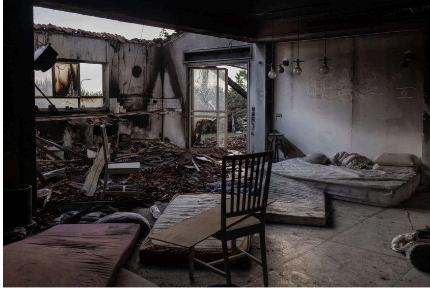
A house in Kibbutz Be'eri, in Israel, that was overrun by Hamas fighters on Oct. 7.

In interviews with more than two dozen current and former Israeli, American and Qatari officials, and officials from other Middle Eastern governments, The New York Times unearthed new details about the origins of the policy, the controversies that erupted inside the Israeli government and the lengths that Mr. Netanyahu went to in order to shield the Qataris from criticism and keep the money flowing.