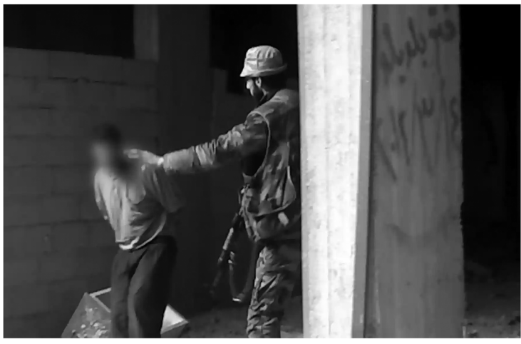
The gunman with a fishing hat in a still from the video.