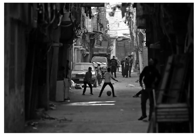
Children play football in a narrow street in Tadamon neighbourhood in the south of the Syrian capital of Damascus in 2018.