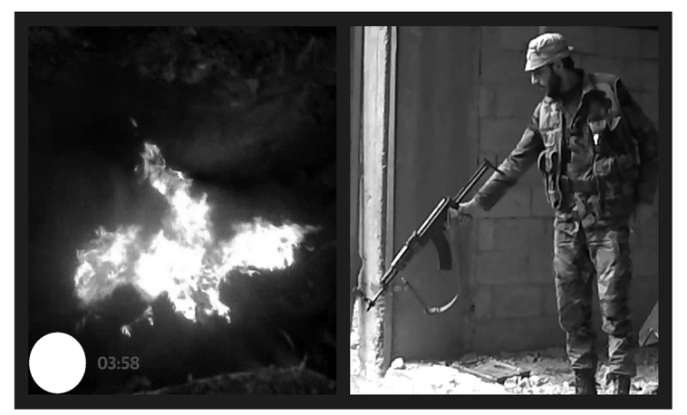
A hidden war crime: footage sheds light on horrors of war in Syria - video explainer

A paralysing nausea took hold of the recruit, who instantly decided the footage needed to be seen elsewhere. That decision has led him, three years later, on a perilous journey from one of the darkest moments of Syria's recent history to the relative safety of Europe. It has also united him with a pair of academics who have spent years trying to get him - the prime source in an extraordinary investigation - to safety while identifying the man who directed the massacre and persuading him to admit his role.