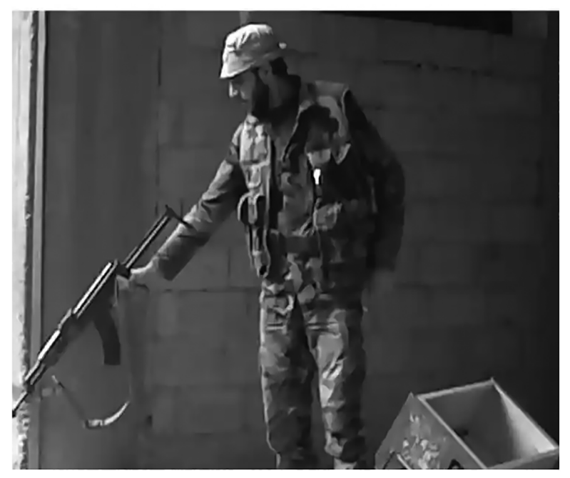
• This article is more than 1 month old

[EDITOR'S NOTE.—This article can also be found at: https://www.theguardian.com/ world/2022/apr/27/massacre-in-tadamon-how-two-academics-hunted-down-a-syrian-war-criminal]